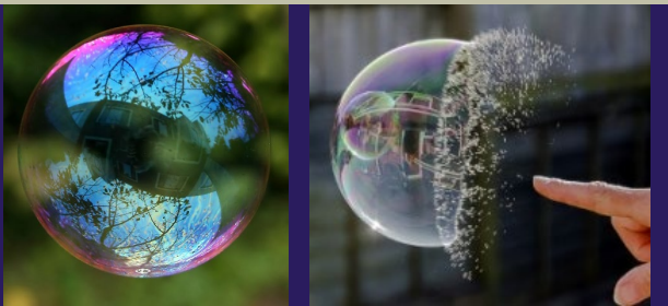
Bursting the savior complex

If you have come here to help me, you are wasting your time. But if you have come because your liberation is bound up in mine, then let us work together --Lilla Watson